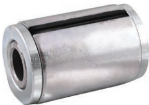
AS. 80125 AS. 80156